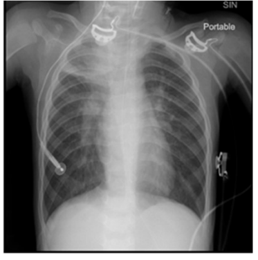
Chest radiograph (anterioposterior view) of the patient on the first day of hospitalization, showing upper right-side pneumonia

Conclusion: Presence of HBoV1 DNA in whole blood and cell-free blood plasma shows that virus is not only present in respiratory tract but is also circulating in the blood. To our knowledge this is the first time HBoV1 mRNA has been detected in PBMCs, suggesting active replication in PBMC.